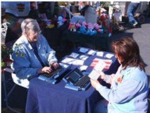
The Farmer's Market Lady